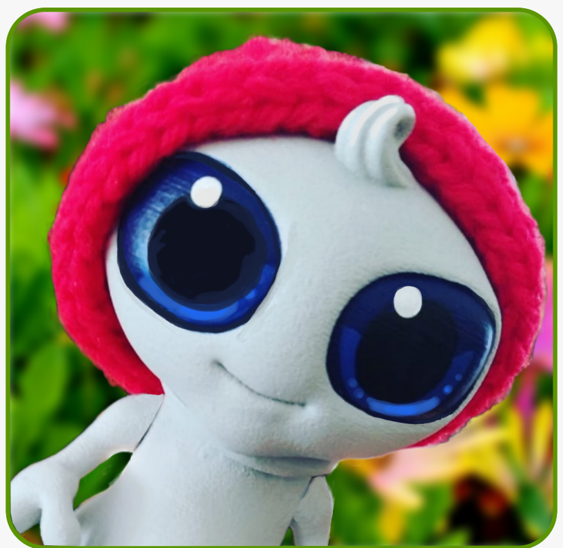
BeeBop Enjoys Earth

NEW BERN, NC, UNITED STATES, April 6, 2023 /EINPresswire.com/ -- This is the story of BeeBop (two e's). A little gray alien with a colorful imagination who dreams of a beautiful place called Earth. BeeBop, encouraged by his grandfather, seeks to find this elusive and beautiful place, if only in his dreams. For us, Earth Day is a day in April. For BeeBop, Earth Day is every day. BeeBop's childlike approach and innocent perspective is contagious. Kids want to share their favorite things about earth, and in doing so, naturally become advocates in their own right. BeeBop (with two e's) just needs to meet some earthlings!