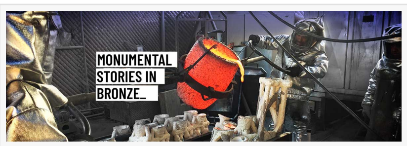
A BETTER FOUNDRY, FABRICATION & INSTALLATION SERVICE