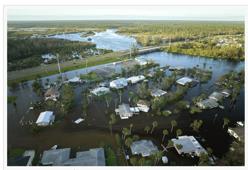
Hurricane Ian damage

CORAL SPRINGS, FL, UNITED STATES, April 6, 2023 /EINPresswire.com/ -- Floridians across the state are facing an increased risk of roof leaks during afternoon showers due to post-hurricane damage. After the powerful winds and torrential rains of recent hurricane lan, thousands of roofs have been left with missing and, or damaged shingles, resulting in a greater likelihood of water seeping through. According to the National