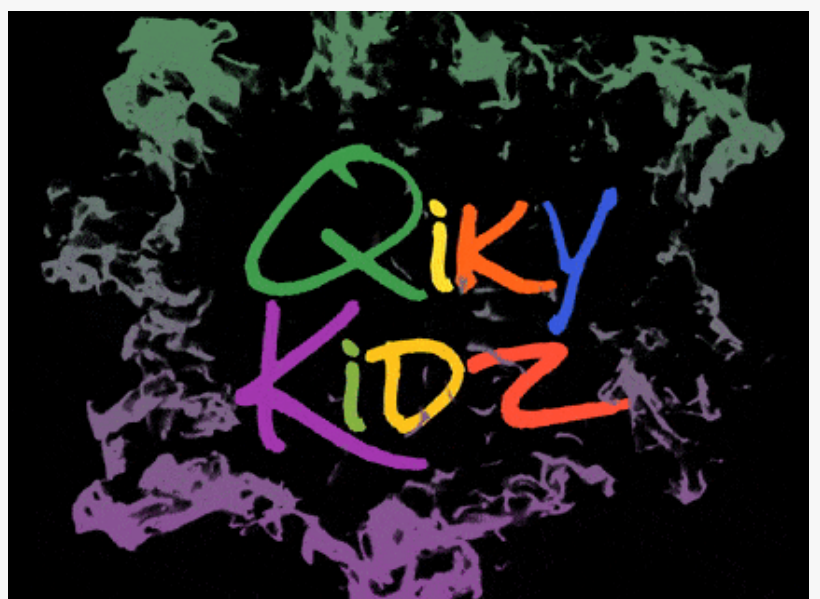
Qiky Kidz - Book Selling For Childrens