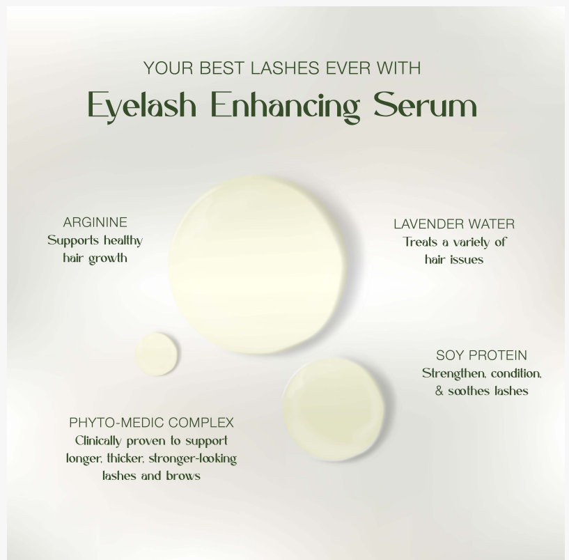
Lashfood Eyelash Enhancing Serum Ingredients

When it comes to the ingredients used in the products, the standards could not be higher. The