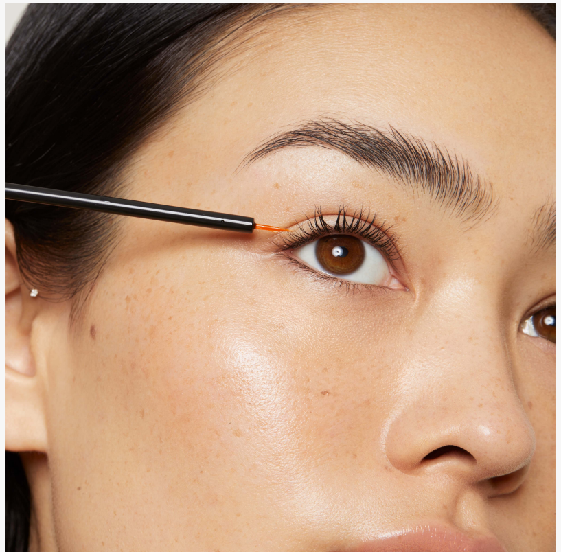
Lashfood Eyelash Enhancing Serum Application

The Clean Ingredients Behind the ECOCERT-Certified Lash Growth Serum