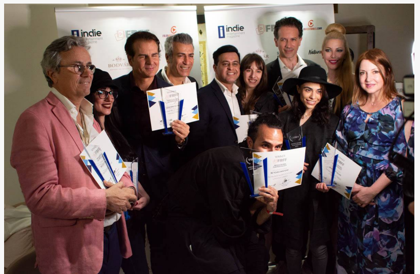
FRFF Awards Ceremony 2019