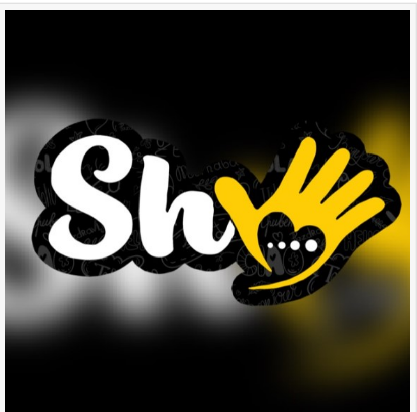
The Shy App

One of the best things about the Shy app is that it only works in social places. This means that users must get out and about their city to find other Shy users to connect with. The app also has an active heat map that allows users to see where other Shy users are, without anyone knowing their location.