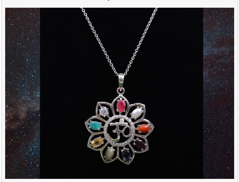
Antique Pendants at Exotic India Art