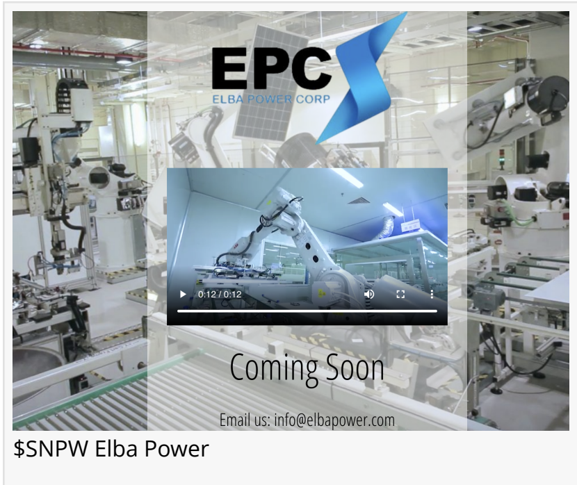
$SNPW Elba Power

□ Working with US Military Contractor Marine Electric