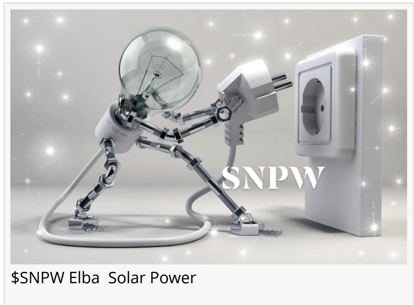
$SNPW Elba Solar Power

SNPW is currently being supplied with advanced solar technology products from top Original Equipment Manufacturers (OEM) in various parts of the world who are best suited to serve their specific territories. In conjunction, SNPW is presently adding highly trained solar technology specialists who have over 30 years of experience in the industry.