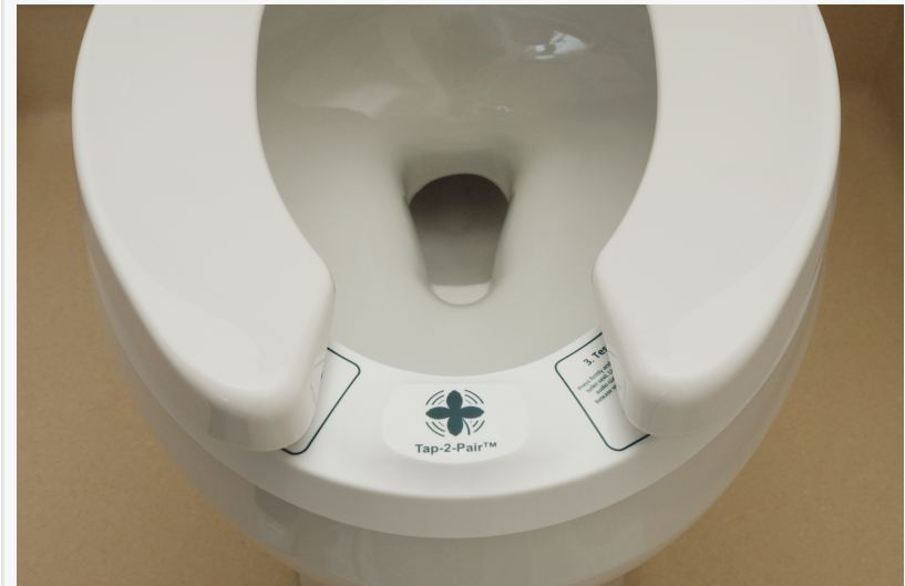
Posey Wireless Toilet Sensor

Simple instructions for use are printed directly on the Wireless Toilet Sensor to guide setup, which includes easy sensor placement on the front of the toilet bowl, underneath the toilet seat. Once active monitoring is confirmed and the patient is seated, the On Cue PRO Alarm will sound when the pressure on the sensor is removed. The Wireless Toilet Sensor is intended for single-patient use for up to 30 days. In addition to the instructions printed directly on the sensor, a paper version of the instructions for use (IFU) is included.