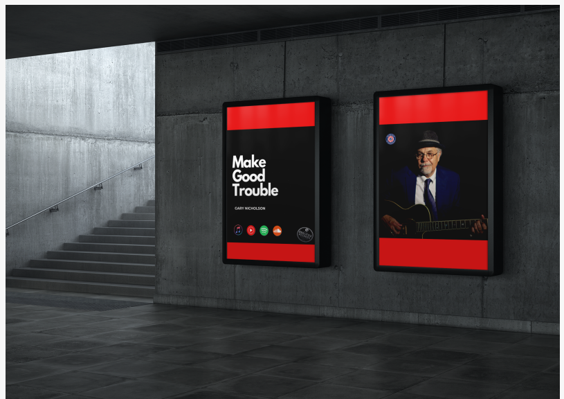
Make Good Trouble

This press release can be viewed online at: https://www.einpresswire.com/article/627118235