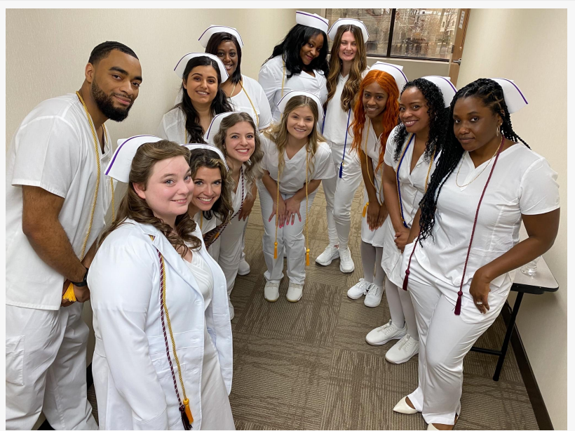
ECPI University Nursing Graduates

VIRGINIA BEACH, VA, USA, April 10, 2023 /EINPresswire.com/ -- In celebration of National Nurses Week (May 6-12), ECPI University will award over $55,000 in scholarships across its nursing campuses in Virginia, North Carolina, South Carolina, Florida, Texas and online. Each scholarship is worth $2,000, and each campus will have two scholarship recipients.