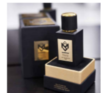
Il brand Soriano Motori lancia per il mercato di moda un nuovo range di profumi ispirati al mondo della moto. Si chiama Attitude. È una collezione di profumi che si ispira al mondo della moto e al mondo dell'arte. Soriano Motori lancia per il mercato di moda un nuovo range di profumi ispirati al mondo della moto e al mondo dell'arte. Soriano Motori lancia per il mercato di moda un nuovo range di profumi ispirati al mondo della moto e al mondo dell'arte.

The models of fashion today, while chic, are socially responsible and innovative as it gets.