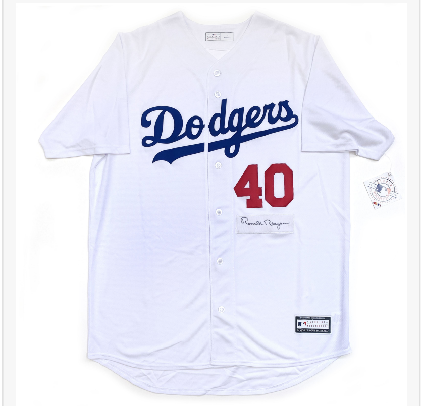
Authentic Major League Baseball Los Angeles Dodgers jersey, boldly signed by Ronald Reagan, with #40 on the front (signifying Reagan being the 40th US President) (est. $3,000-$3,250).