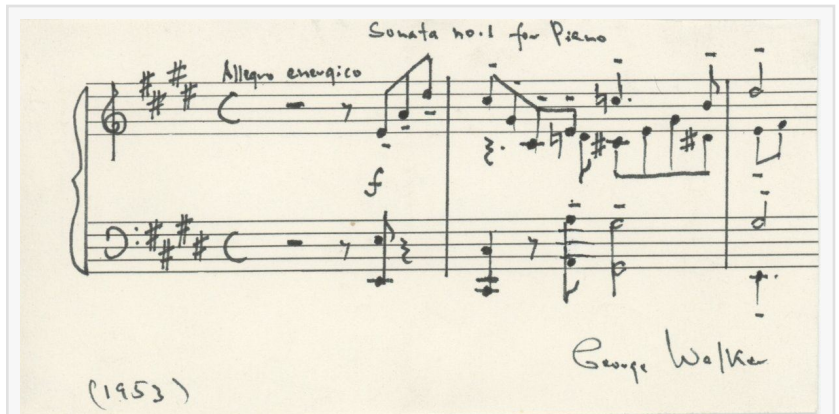
Sheet music for Sonata No. 1 for Piano (1953), handwritten and signed by George Walker (1922-2018), the first African American to win the Pulitzer Prize for Music (est. $400-$500).

An artist autographs archive of 14 notable 19th century American and European artists and