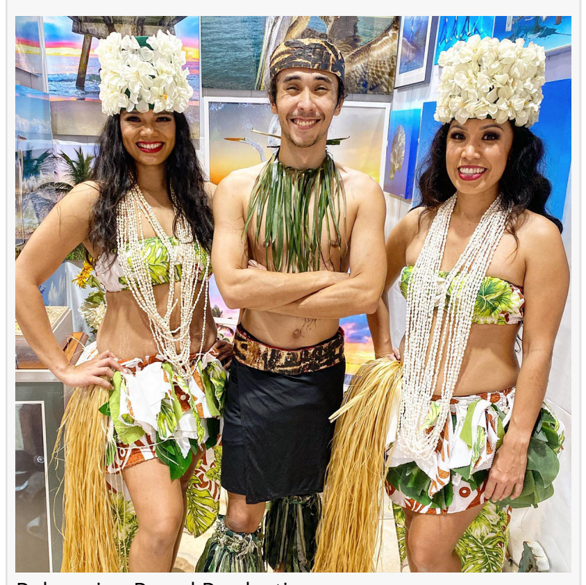
Polynesian Proud Productions