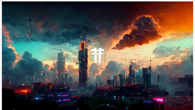
Teritori Announcement Header

Among the innovative projects that are still under the radar, the Teritori.com project is gradually showing signs of being a very solid project in its technical and philosophical approach.