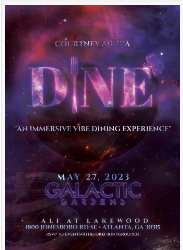
Flyer for DINE - immersive vibe dining experience