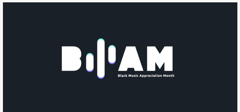
Black Music Appreciation Month Europe