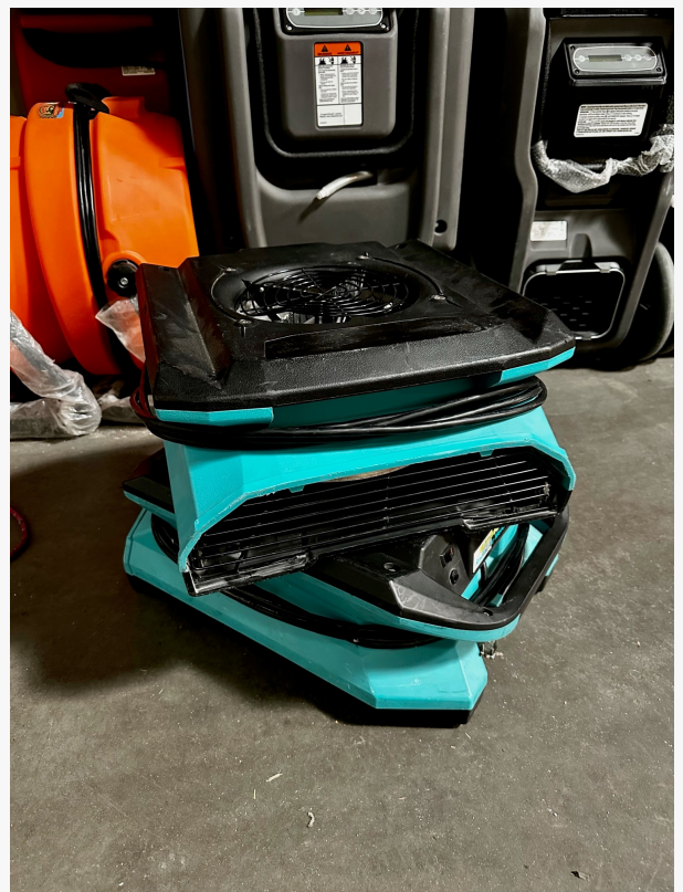
Efficiently Dry Out Water Damaged Areas with Powerful Air Movers.