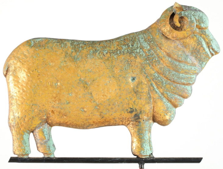
Circa 1880 molded sheet copper merino ram weathervane for the Emery Wool Company in Boston (once the wool capital of the world), 29 inches long (est. $20,000-$40,000).