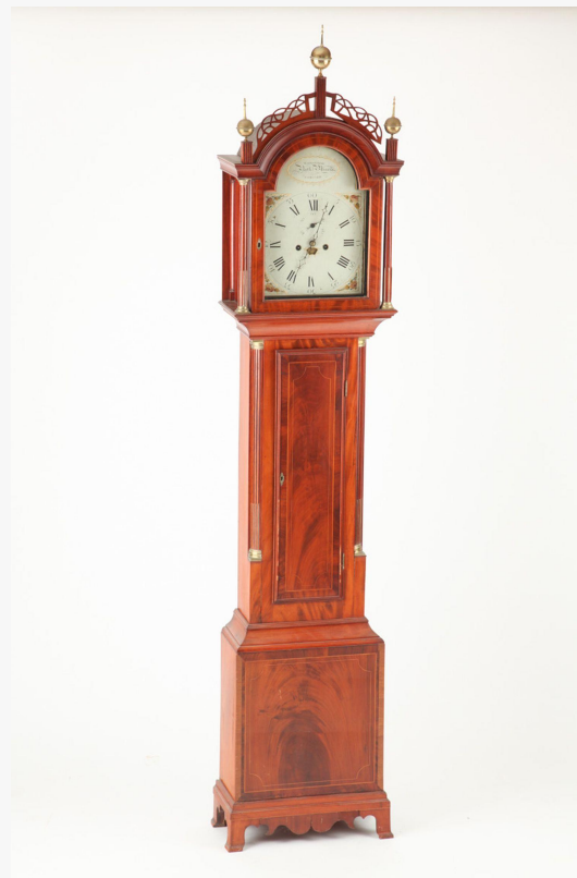
Mahogany tall case clock by Nathaniel Monroe (Concord, Mass.), having a pierced gallery crest with original faceted ball finials, 94 ½ inches tall and 20 ¼ inches wide (est. $6,000-$12,000).