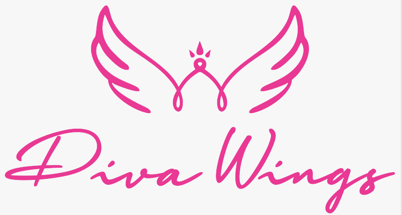
Diva Wings Logo

The Diva Wings offers simple storage and easy access. Shaped like a pair of angel wings, The Diva Wings is made of soft velvet with an extended hook. The wing span is 17 1/4 inches, allowing adequate space to accommodate more bras than most organizers. The height of the wings prevents the bras from twisting and turning. While the angle of the wings prevents slipping as well as stacking. The female founder came up with the idea after snagging one of her own lace bras entangled in the drawer. She vowed to never again let one of her bras be destroyed. It is one of those things only a woman could understand.