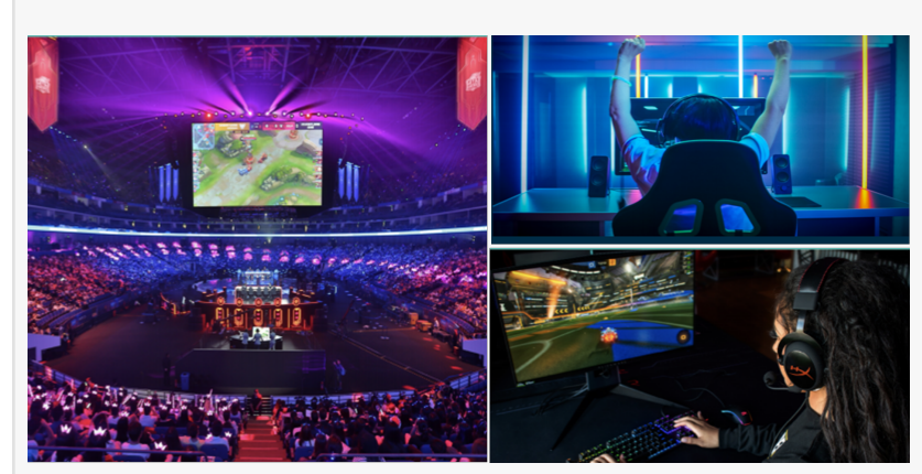
US-Nordic Cup for esports

This press release can be viewed online at: https://www.einpresswire.com/article/627788054 EIN Presswire's priority is source transparency. We do not allow opaque clients, and our editors try to be careful about weeding out false and misleading content. As a user, if you see something