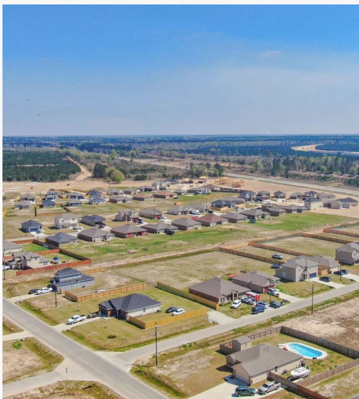
The Northeast Houston Area's Colony Ridge Communities are experiencing rapid growth.

This press release can be viewed online at: https://www.einpresswire.com/article/627827391