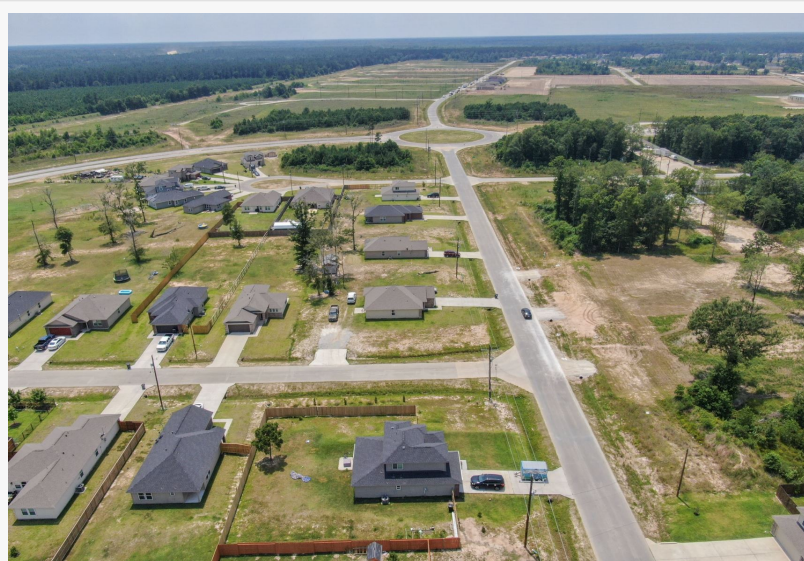
A new fitness center will cater to the Colony Ridge Communities located in the North Houston Area.