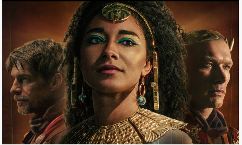
Netflix - Queen Cleopatra

This press release can be viewed online at: https://www.einpresswire.com/article/627847252