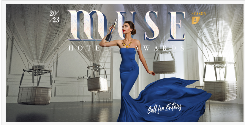
2023 MUSE Hotel Awards: Season 2 Calling for Entries

"I would like to sincerely commend all the astounding hospitality and tourism excellence demonstrated in the awards that lead to the ultimate consumer