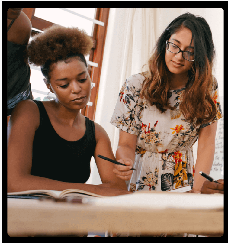
Virtual Assistant Services India

7. Data Entry Virtual Assistant - A data entry virtual assistant is a remote employee who provides data entry tasks for individuals or businesses. They work remotely and use their skills to help businesses with data entry, data management, and organization. They are skilled in using various tools and are detail-oriented, accurate, and efficient in handling data-related tasks.