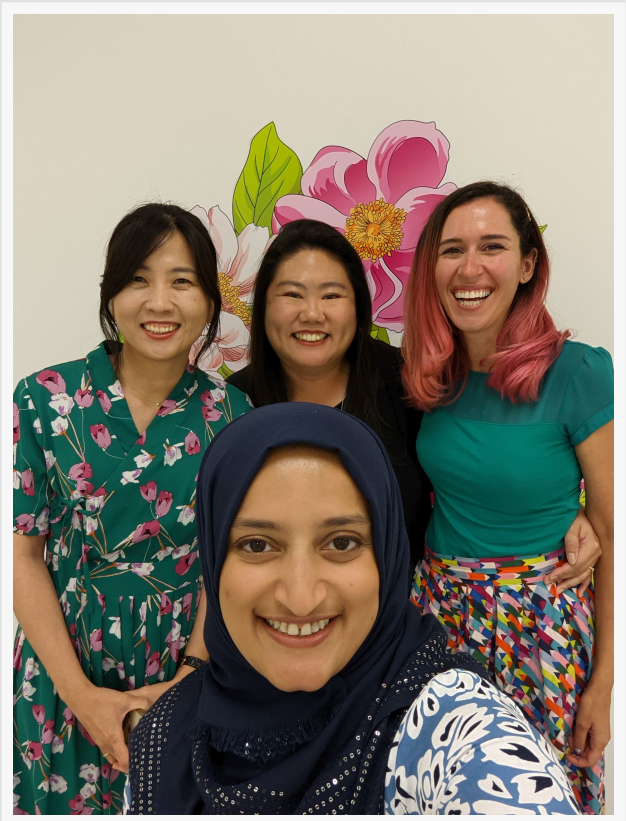
Some of the ladies of Altenew Leadership Team, all-smiles during the company's August 2022 Retreat

"We are thrilled to announce that Altenew is approaching its 9th anniversary! We feel so thankful to be a part of this amazing community of crafters