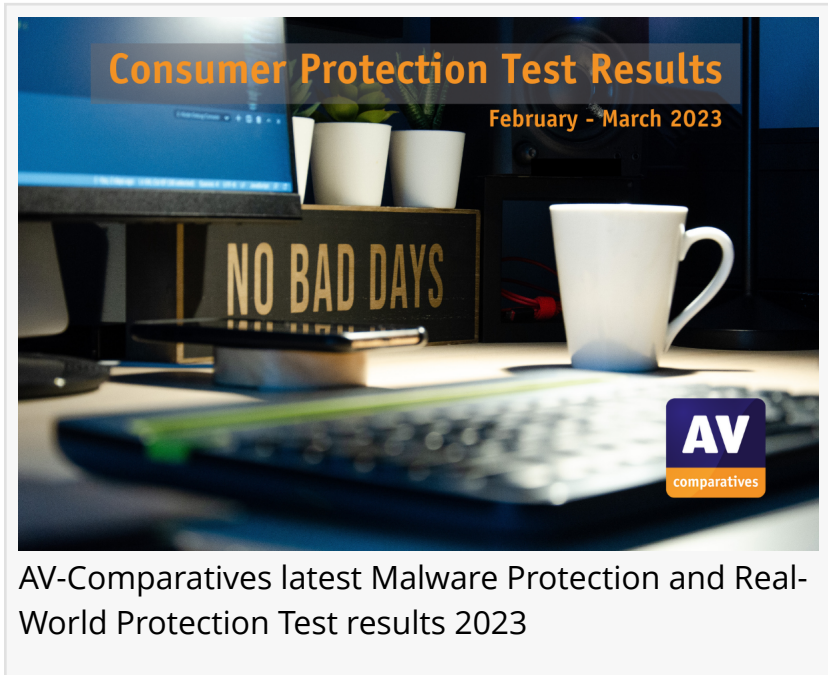
AV-Comparatives latest Malware Protection and Real-World Protection Test results 2023

Peter Stelzhammer, co-founder AV-Comparatives