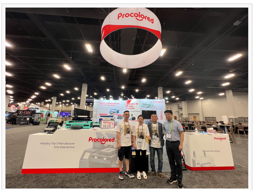
procolored's booth at ISA 2023

Procolored <u>DTF Printer</u>: Procolored's Direct-to-Film (DTF) printer was a popular attraction at the expo. Visitors were impressed by its ability to produce high-quality, vibrant, and