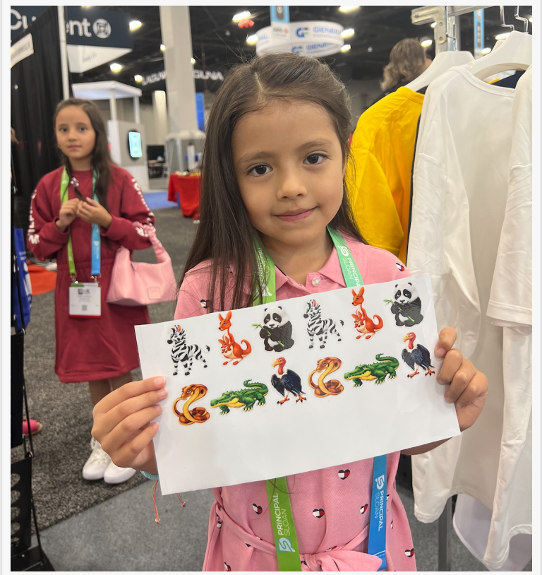
A little girl easily print signs with procolored's uv dtf printer

Procolored Anti-Clogging Technology: Procolored's Anti-Clogging Technology was a highlight for many visitors. They were