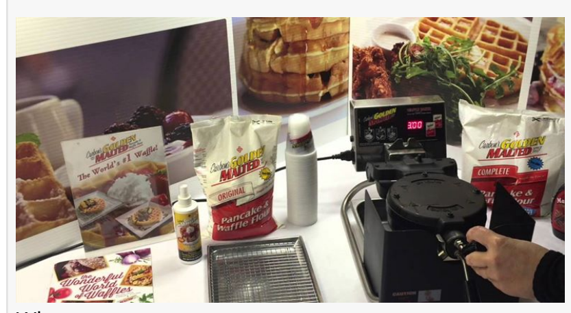
What a setup