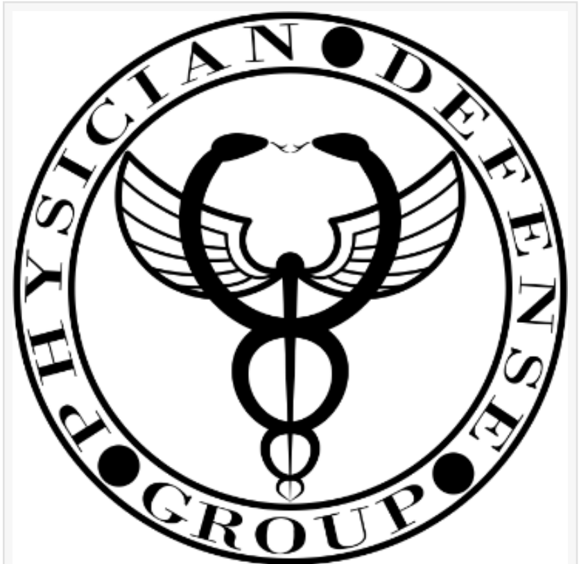
Logo of Physician Defense Group, online reputation management for medical doctors