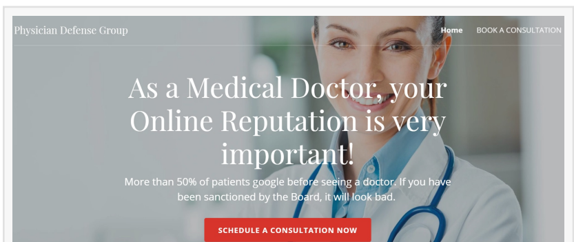
Website Physician Defense Group, Miami Beach FL

Such adverse information can severely damage a physician’s ability to continue medical practice. Potential financial losses can be significant because someone finding such information on the