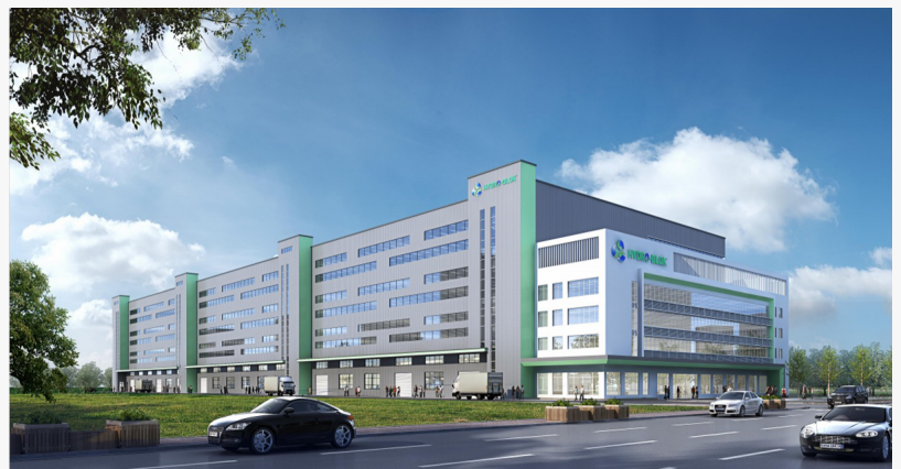
The new manufacturing facility planned in Bangkok Thailand

HYDRO-BLOK is also launching the company's new uncoupling membrane product line which is designed to provide additional support for tile and stone installations. What sets this new uncoupling membrane product apart is its cost-effectiveness. The product is priced competitively, making it an affordable option for contractors and builders looking to save money on their projects. The product's easy installation also helps to save time and labor costs. HYDRO-