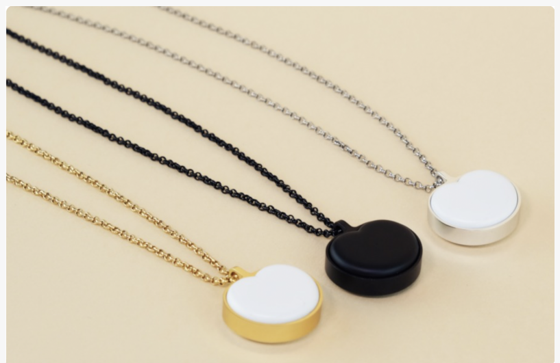
Bond Heart in Black, White and Gold

MENLO PARK, CA, USA, April 17, 2023 /EINPresswire.com/ -- Bond Touch , the pioneer in emotional wearables, is pleased to debut its newest innovation, Bond Heart . This first-of-its-kind accessory, a smart necklace that captures loved ones' heartbeats so they can be worn and felt close to one's own, is now available for $99.00 at www.bond-touch.com and Amazon .