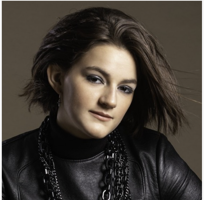
Kjersti Long, Pop/ Rock/ Indie Artist

NEW YORK CITY, NY, UNITED STATES, May 1, 2023 /EINPresswire.com/ -- On occasion, the words musical prodigy are used as hype; yet in the case of 16 year old Kjersti Long (pronounced 'care-see'), they ring true. Kjersti has performed at the most iconic venues in the country, selling out standing room only headlining events at The Bitter End NYC) along with The Delancey (NYC). She's also had landmark performances at the legendary Apollo Theater(NYC), The Stone Pony (Asbury Park, NJ), Velour Live Music Gallery (Provo, UT) and the House of Blues (San Diego, CA).