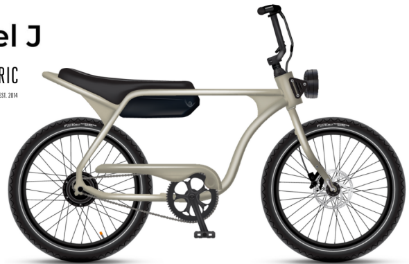
Model J Electric Bike Company Sunset Gray