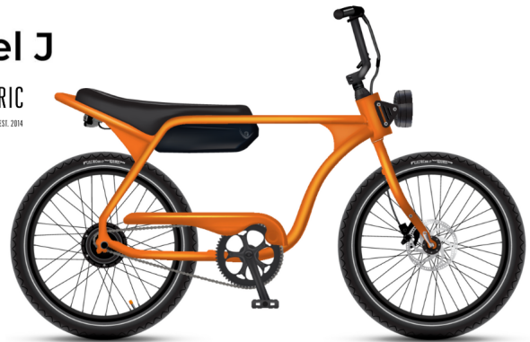
Model J Electric Bike Company Orange Crush