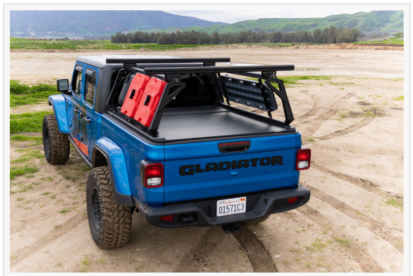
EGR USA's Ultimate Overlanding Jeep Gladiator features top branded products from Leitner, TACTIK, NITTO, Rock Slide Engineering and more

Overland Expo's four events are billed as the premier overlanding event series in the world bringing together hundreds of exhibitors and thousands