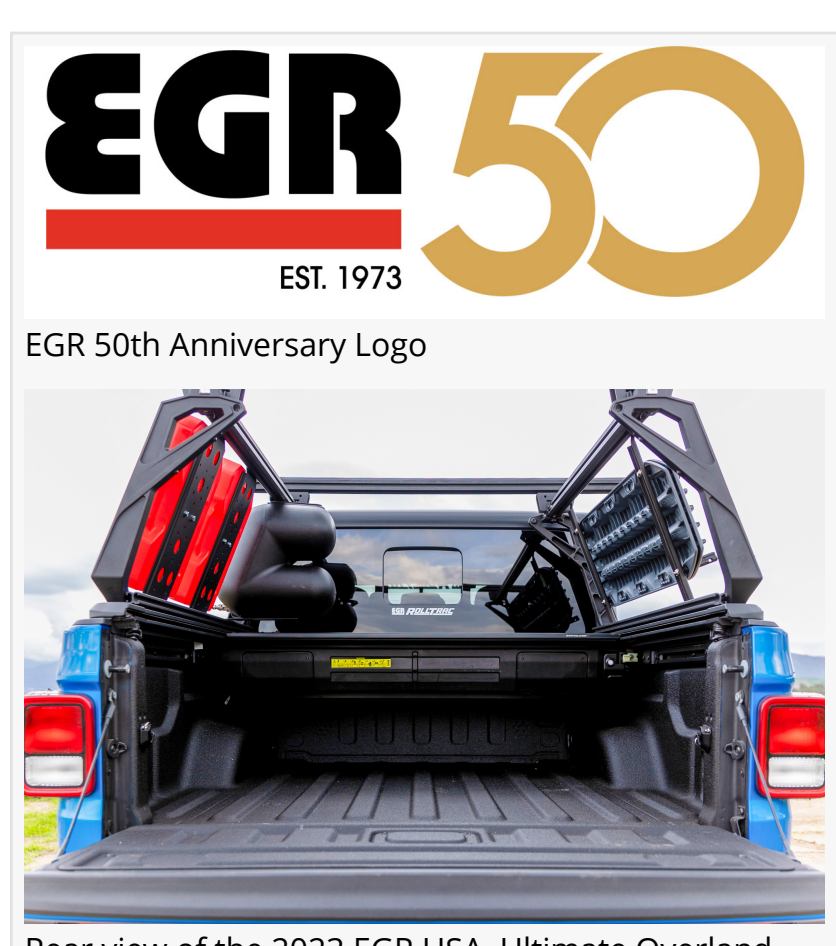
Rear view of the 2023 EGR USA Ultimate Overland Jeep Gladiator JT

The EGR RollTrac was originally built for the Jeep Gladiator in the US and has been tested and proven to handle all climate and weather conditions from harsh desert, tropical rainfall, beach driving with exposure to sun and sand to extreme cold and snow. Designed with a best-in-class water management system, the cover's interlocking UV protected aluminum slat surface prevents water from penetrating into the bed so expensive gear stays dry. All water is funneled under the vehicle. A cleverly engineered compact canister shaped in a concave design allows for maximum bed space use and keeps water from entering the bed. The electric bed cover integrates with the vehicle's remote central locking for maximum security to ensure gear is protected.