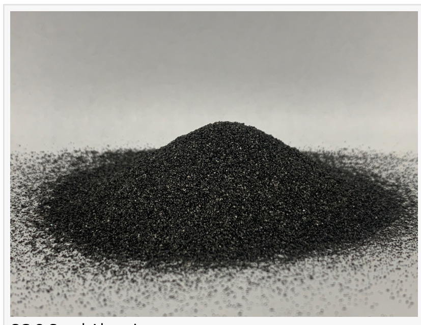
SC-8 Steel Abrasive

SC-8 Steel Abrasive is perfect for use on a variety of applications, including precoat blasting for powder coating, removal of coating overspray on fixtures, blasting new steel to remove mil scale prior to a manufacturing process, precoat blasting where mil