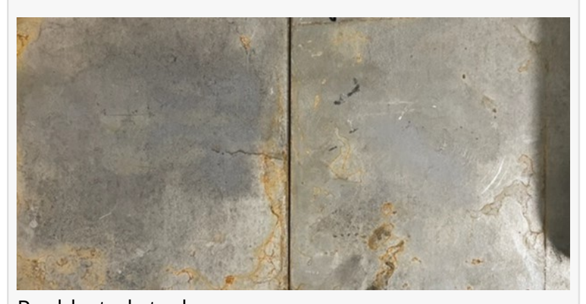
Pre blasted steel

profiles of .8 to 1,2 are desired (using first pass material) making it an ideal economical option for one pass abrasive use in the field.