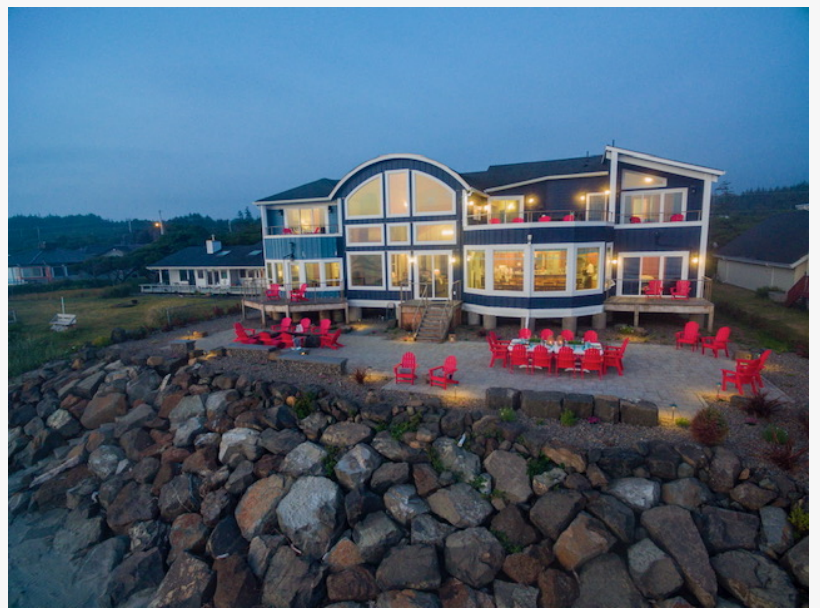
Vacation Rental Designers Cliftside Escape.

community of members, with a jam-packed program with everything you need to know to get started in your own vacation rental design business as well as access to exclusive industry partners and a private online community of like-minded creatives.