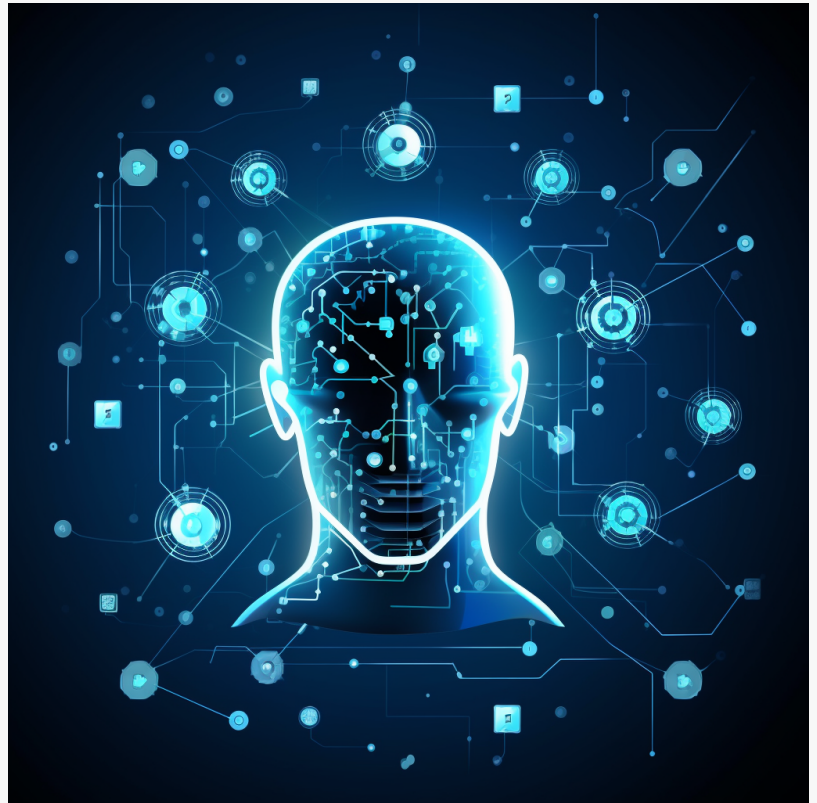
AI Digital Marketing Expert