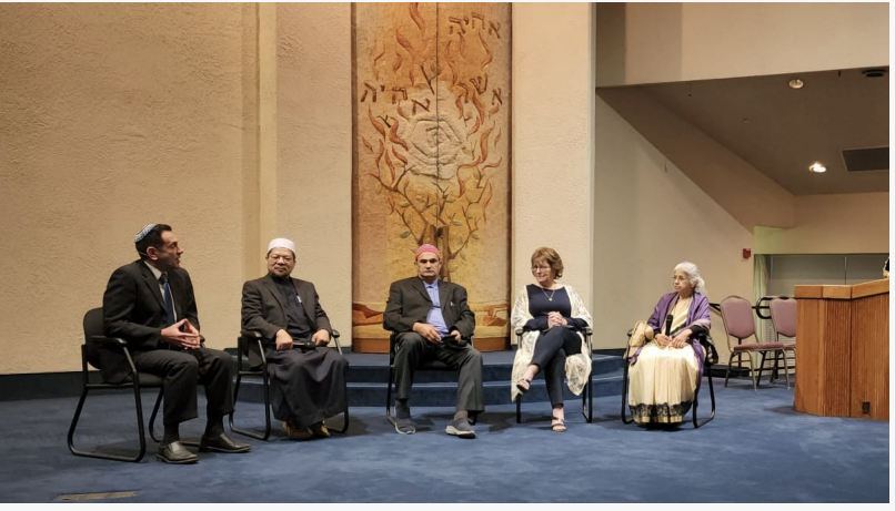
Multifaith leaders shares ways to build resilience against hate

on hate just as these two communities had often in history, stood with each other in history.