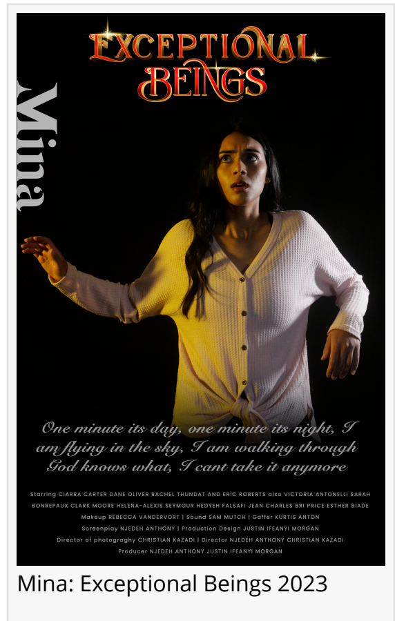
Mina: Exceptional Beings 2023