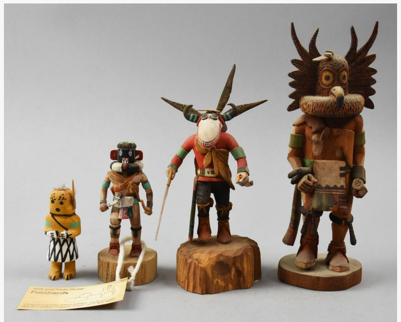
Group of four kachina (or katsina) dolls, each one representing a different purpose and three of them artist signed, ranging in height from 4-9 inches tall (est. $60-$150).