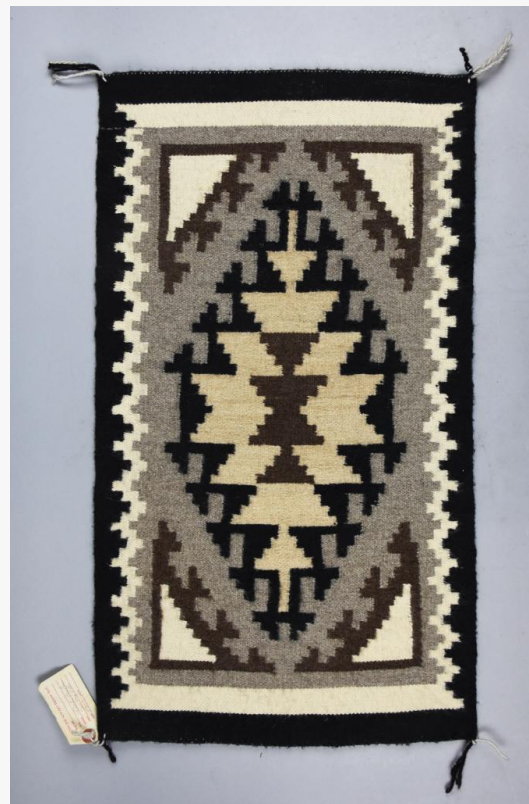
Vintage Two Grey Hills rug from Navajo weaver Alberta Henderson, 15 by 27 inches, with a geometric diamond pattern in grey, black tan and off white (est. $200-$2,000).