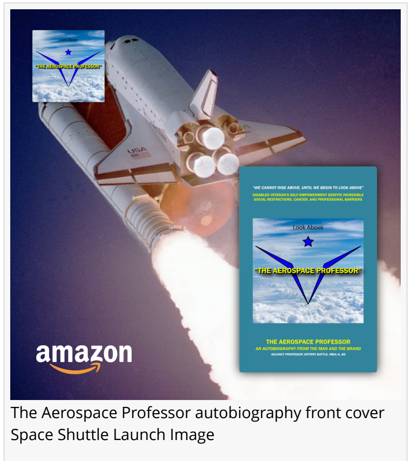
The Aerospace Professor autobiography front cover Space Shuttle Launch Image

This press release can be viewed online at: https://www.einpresswire.com/article/628636760 EIN Presswire's priority is source transparency. We do not allow opaque clients, and our editors try to be careful about weeding out false and misleading content. As a user, if you see something we have missed, please do bring it to our attention. Your help is welcome. EIN Presswire, Everyone's Internet News Presswire™, tries to define some of the boundaries that are reasonable in today's world. Please see our Editorial Guidelines for more information. © 1995-2023 Newsmatics Inc. All Right Reserved.