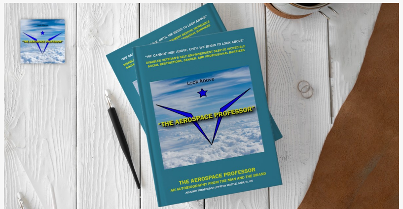
The Aerospace Professor Autobiography Desktop image