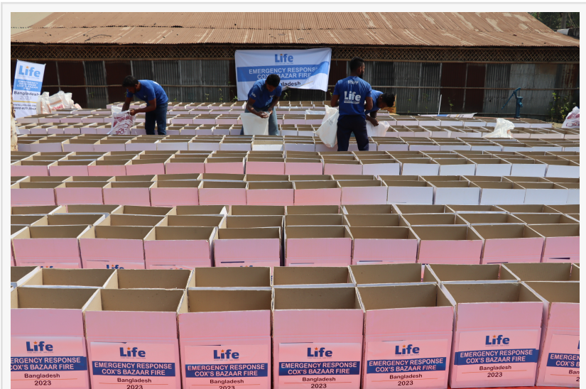
Volunteers Preparing Emergency Aid Boxes

“I can't imagine what life would be like to think you've already lost everything, just for a fire to start, 'burning down' whatever last bit of hope you had; it's devastating, and LIFE wanted to