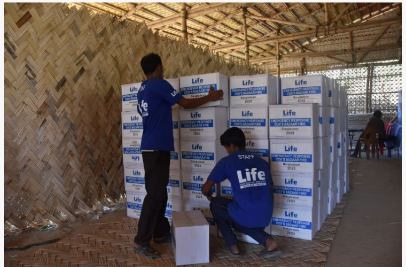
Volunteers Getting Boxes Ready for Distribution

This press release can be viewed online at: https://www.einpresswire.com/article/628678357