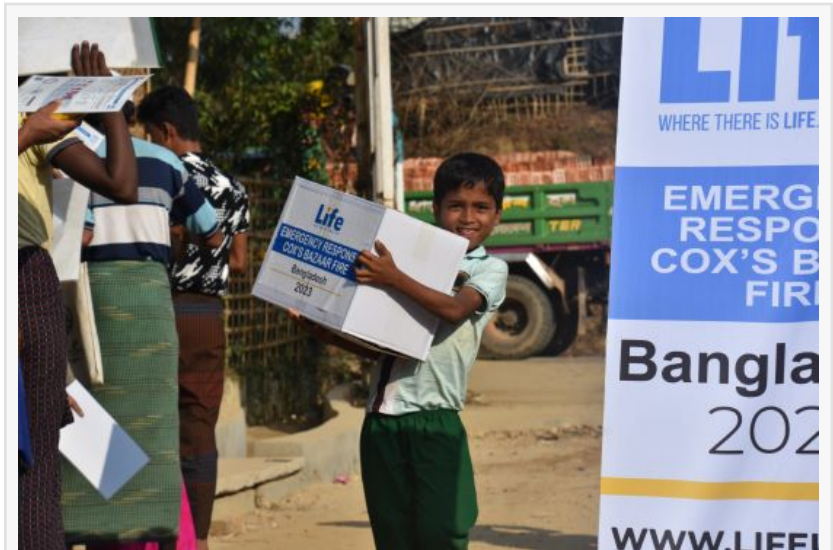
Families Affected by the Fire Receiving Emergency Aid