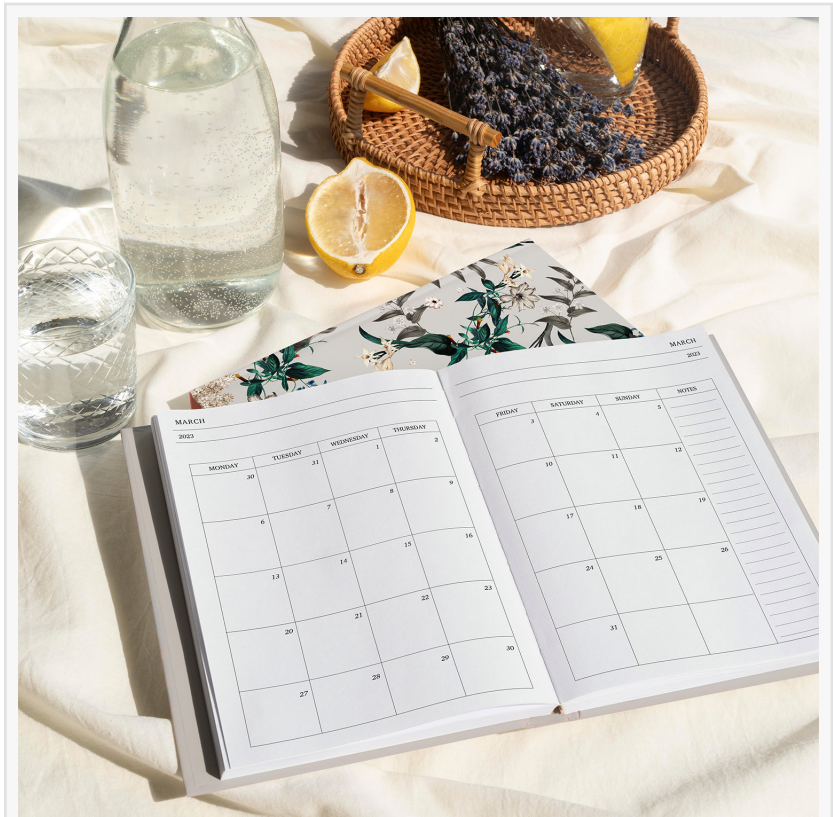
Hermoza Designer Floral Hardcover Executive Weekly Planner