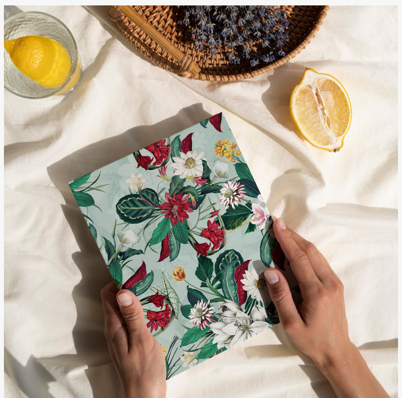
Hermoza Designer Floral Hardcover Executive Notebook, Light Cyan Blue

The Hardcover Executive Notebooks and Planners by Hermoza Design are not only stylish but also highly practical. The notebooks are available with 120 gsm premium sheets, making them suitable for note-taking, journaling, and sketching. The Weekly Planners, on the other hand, come with monthly, weekly, and daily spreads, allowing users to plan and organize their schedules with ease.