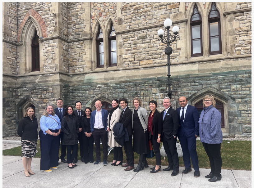
Delegation of Canada's leading liver experts and community advocates from CASL gathering on Parliament Hill

Non-Alcoholic Fatty Liver Disease (NAFLD) is one of the most common liver diseases, affecting approximately 25% of Canadians. However, a lack of awareness and understanding of the disease often leads to delayed diagnosis and treatment, which can result in severe health complications or even liver cancer requiring a transplant. CASL seeks to raise awareness about