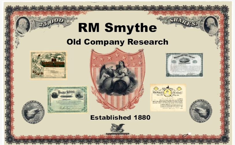
RM Smythe Since 1880

Scripophily (scrip-ah-fil-ly) is the name of the hobby of collecting old stock and bond certificates. Certificate values range from a few dollars to more than $500,000 for the most unique and rare items. Tens of thousands of Scripophily buyers worldwide include casual collectors, corporate archives, business executives, museums and serious collectors. Due to the computer age, more and more stock and bonds are issued electronically which means fewer paper certificates are being issued. As a result, demand for paper certificates is increasing while supply is decreasing.