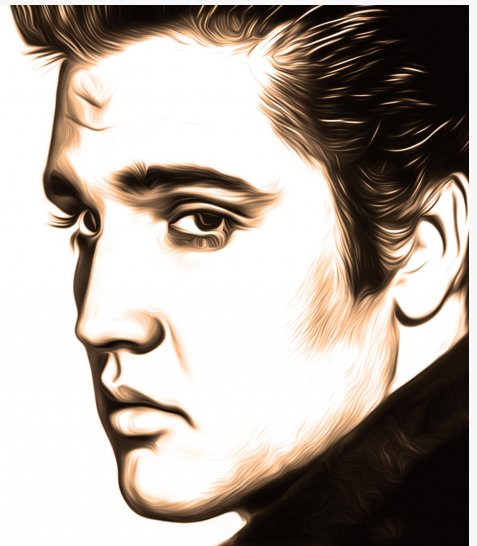
The Elvis Conspiracy reimagines the legacy of Elvis Presley as alternative history.