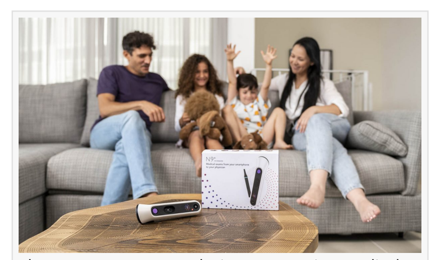
The N9+ a remote care device powers nine medical exams from smartphone to physician

CAESAREA, ISRAEL, April 19, 2023 /EINPresswire.com/ -- Nonagon, a fast-growing medical device company based in Israel and the US, has received FDA clearance to sell its N9+ device as an over-the-counter product, making remote patient examinations more accessible than ever. The Nonagon N9+ device allows for clinical-grade remote examinations of various