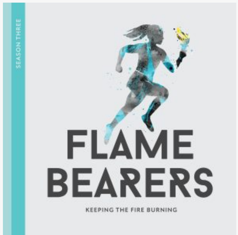
Flamebearers Season 3